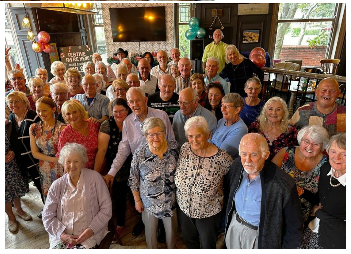
Happy group enjoying the Anniversary celebration.