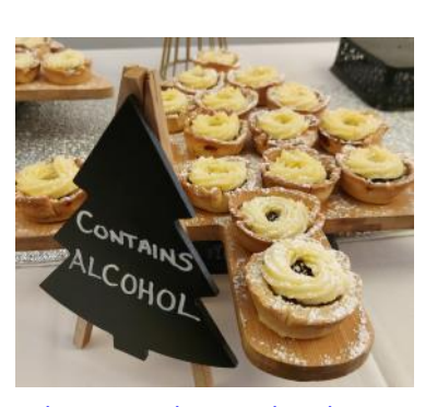
These tasted as good as they look!!