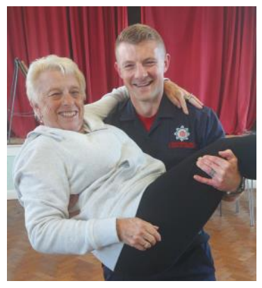
They've already started!! Please stay safe - ear plugs ready,

pets safe and secure indoors and if you are outside watching displays, maintain a safe distance at all times.