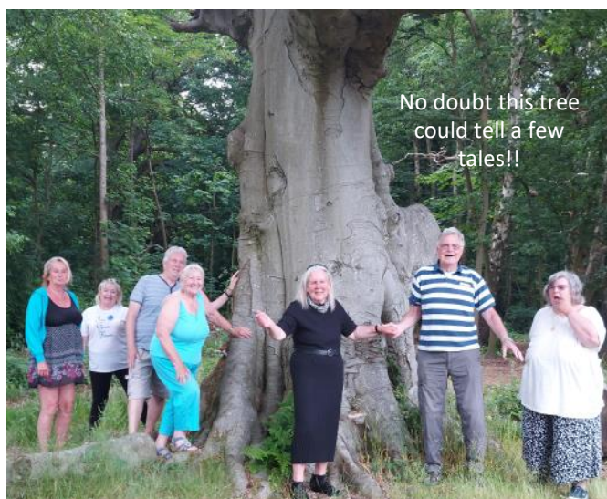
No doubt this tree could tell a few tales!!

We first of all wandered round the grounds including a bit of tree hugging and a picnic, then later, we visited the Hall which is beautiful. A brilliant day out.