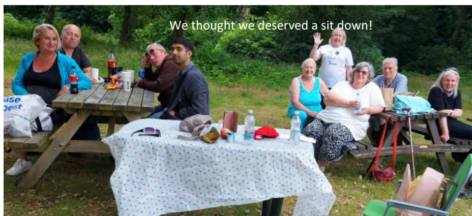
We thought we deserved a sit down!