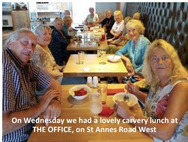
On Wednesday we had a lovely carvery lunch at THE OFFICE, on St Annes Road West