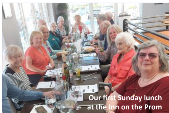
Our first Sunday lunch at the Inn on the Prom