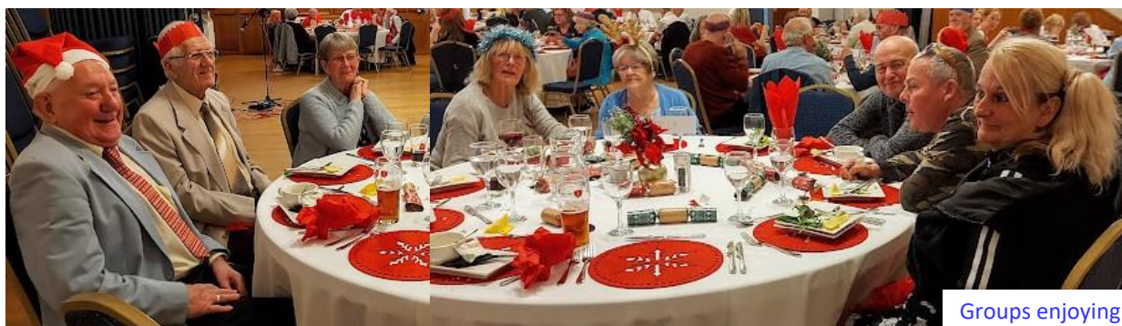
Groups enjoying Christmas Lunch!