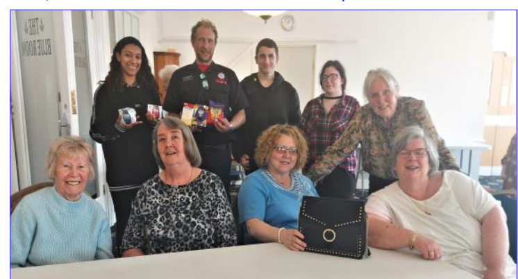
Thanks so much to the Prince's Trust for coming to see us and doing the very interesting quiz. Well done the naughty table for winning 1st prize!

It's just another tool for us all to stay in touch but for those of us who don't use our mobiles in this way, the information therein can always be found either on our website, Facebook or sometimes in the monthly Newsletter.