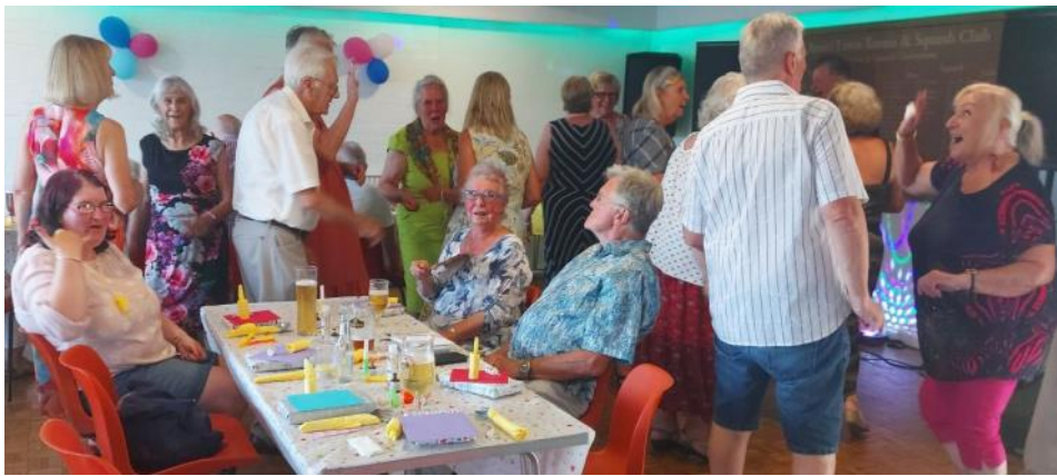
Some of the lucky raffle winners