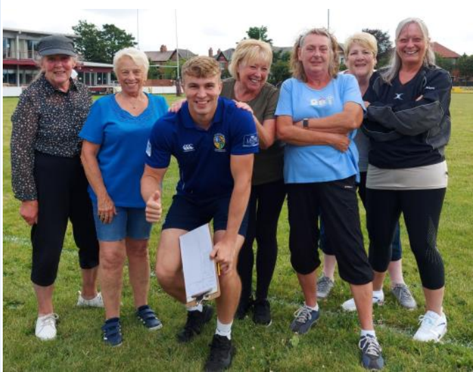
JGF Walking Rugby Team - it's great fun and exercise too at the Fylde Rugby Club. Every Tuesday night at 6.30pm