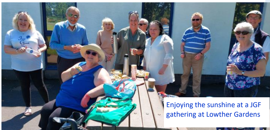
Enjoying the sunshine at a JGF gathering at Lowther Gardens

Happy birthday to all of you with August birthdays, especially the two who have reached their special 80th birthdays!