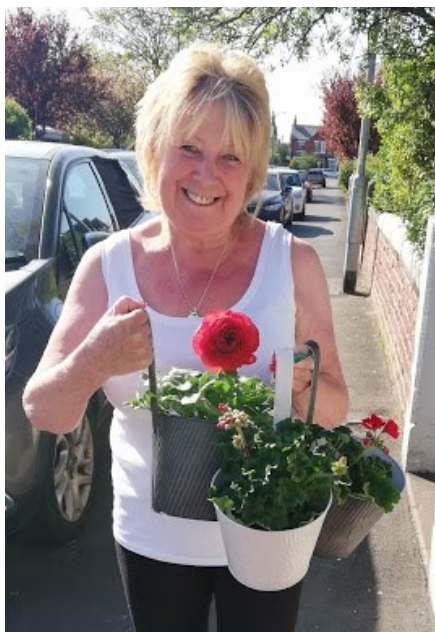
Still delivering the many beautiful donated plants

Let's just keep counting our blessings in whatever form they take.